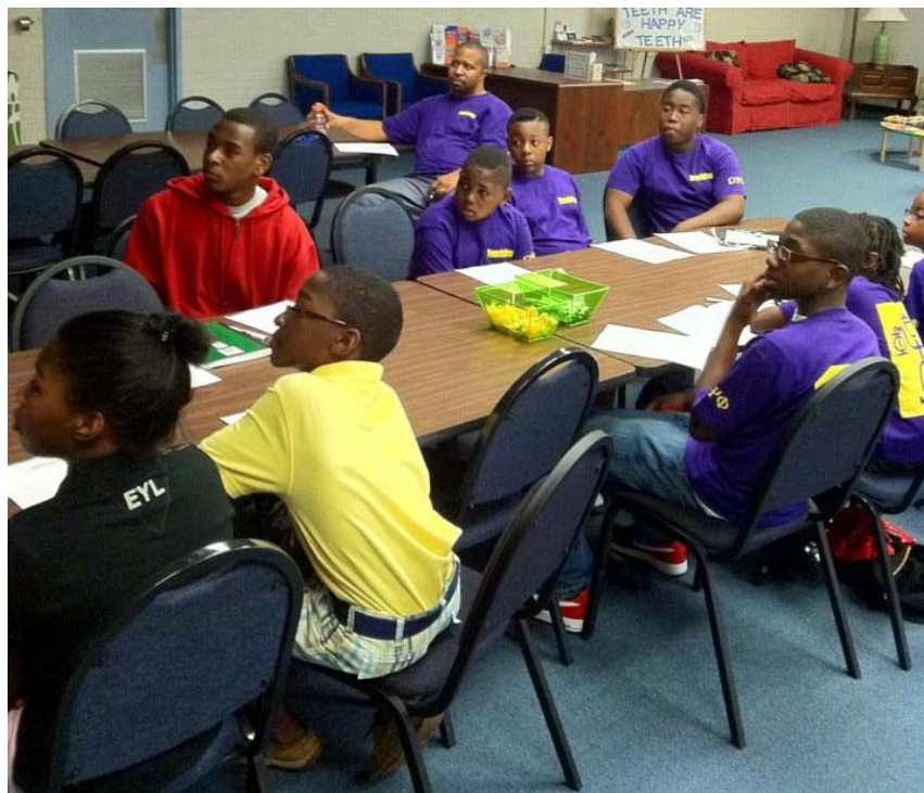
Foundation members listening to instructions on public speaking

Foundations: Omegas working with young Black males