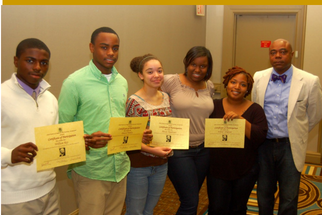
Northwestern High School Students display their certificates for participating in the Sixth District's African American Quiz Bowl Championship in Greenville, SC.

The 2012 International winners will be announced during the Omega Psi Phi Fraternity, Inc's International Grand Conclave in Minneapolis, Minnesota, July 5th - July 12th, 2012.