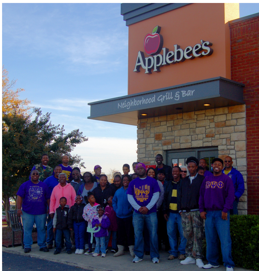
Kappa Alpha Brothers and Blackmon road residence at Applebees

March 15th - 3rd Council Meeting April 25th - 68th Annual Meeting August 1st - Leadership Conference