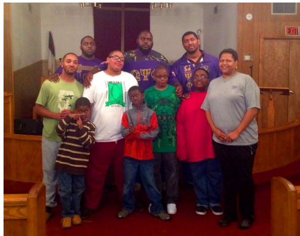
Members of Psi Kappa and Gilmore Chapel AME

CONCORD, NC - The Psi Kappa Chapter of Omega Psi Phi Fraternity, Inc., traveled north of the boarder to assist with a mentoring project at Gilmore Chapel AME Zion Church.