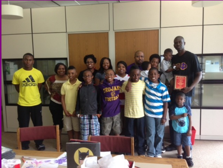
Members of Foundations and EMBODI during the end of year celebration

ROCK HILL, SC - On Saturday May 18, 2013 the Rock Hill Alumnae Chapter of Delta Sigma Theta Sorority, Inc. and the Kappa Alpha Chapter of Omega Psi Phi Fraternity, Inc., held the final meeting of the school year with their mentoring program EMBODI and Foundations at the Rock Hill Library.