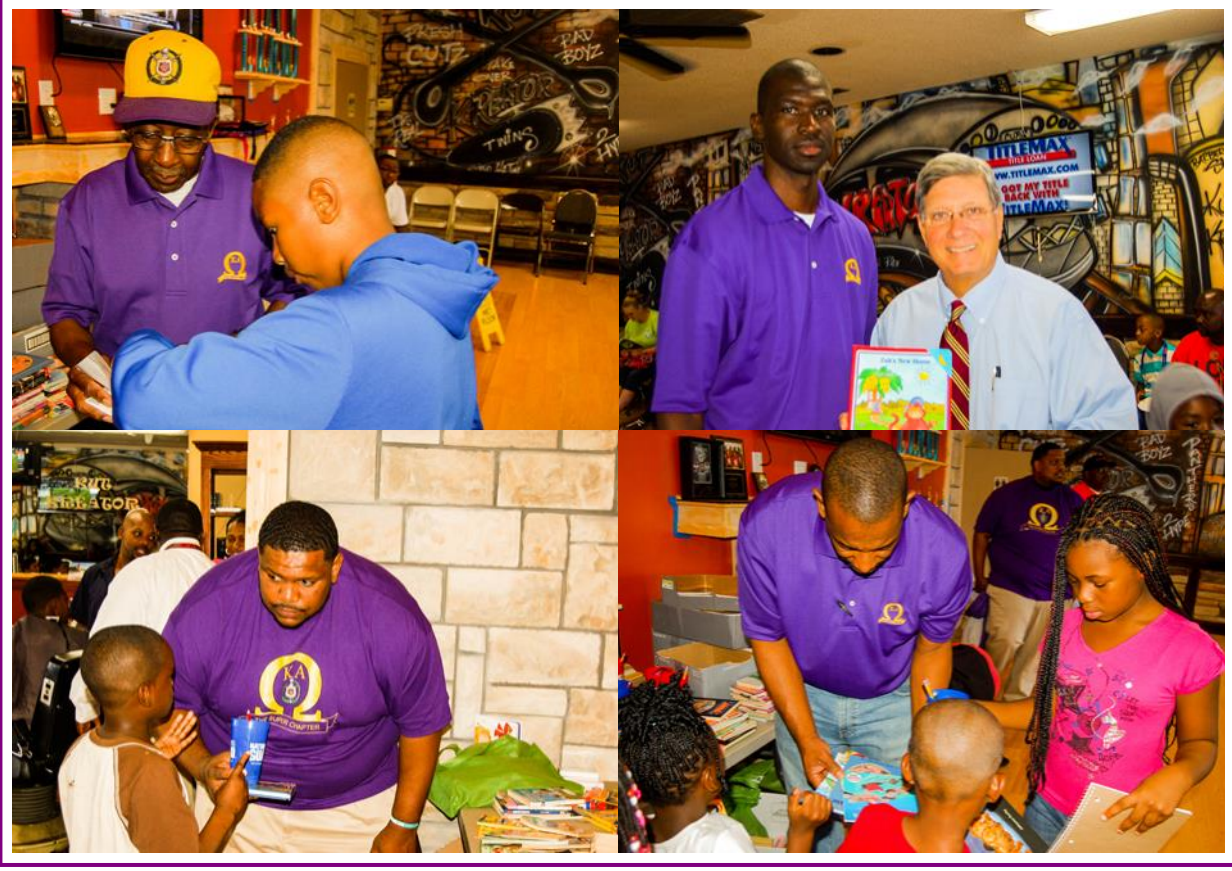
The Mighty Sixth District Centennial Chapter of the Year