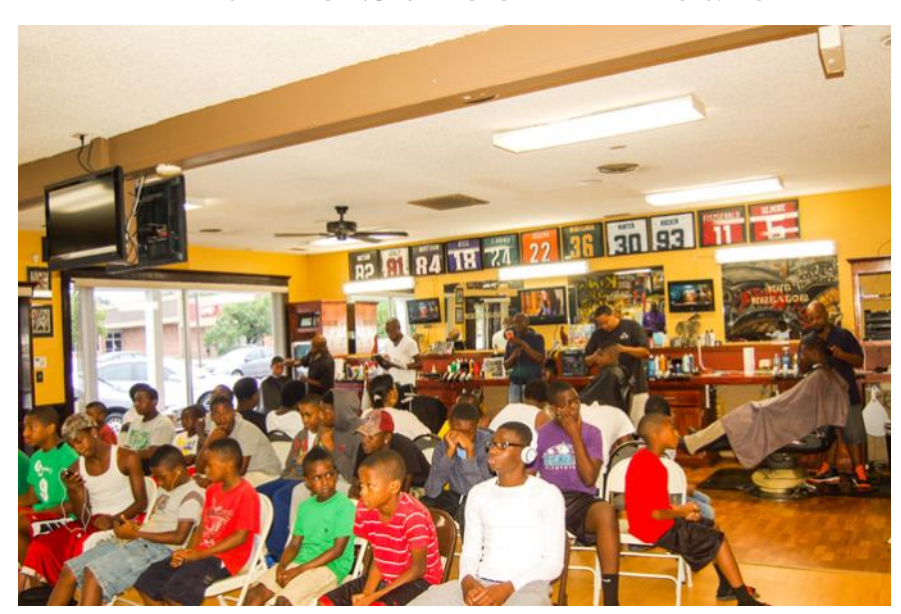
Students from Rock Hill, York, Chester waiting patiently at Kut Kreator Barbershop for their Free Back to School Hair cut

ROCK HILL, SC – The Kappa Alpha Chapter of Omega Psi Phi Fraternity, Inc., and Kut Kreator Barbershop held the 4<sup>th</sup> Annual Free Back to School Haircuts.