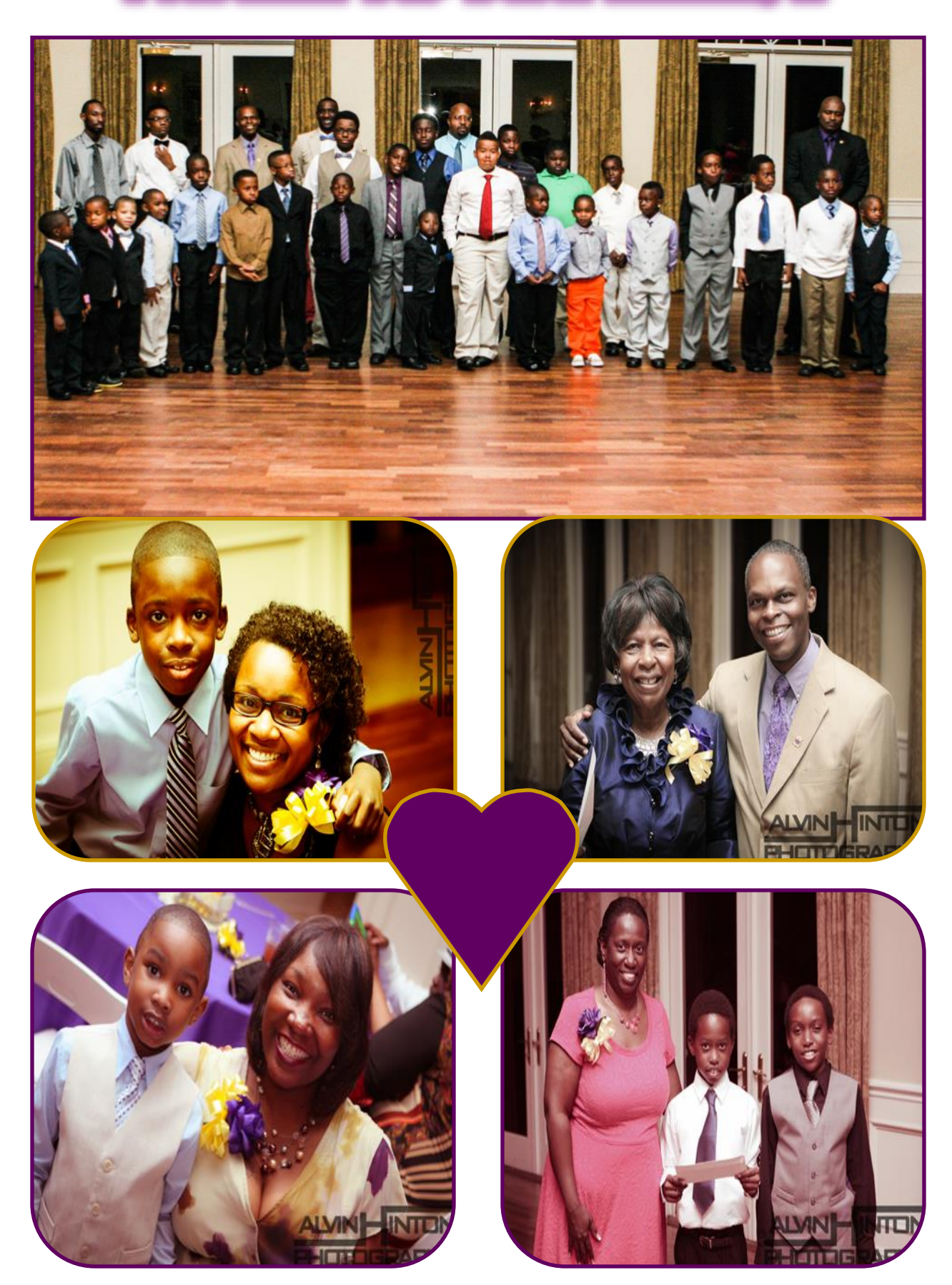
The Mighty Sixth District Centennial Chapter of the Year