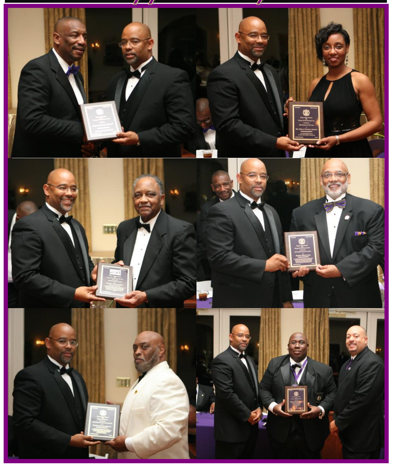
The Mighty Sixth District Centennial Chapter of the Year