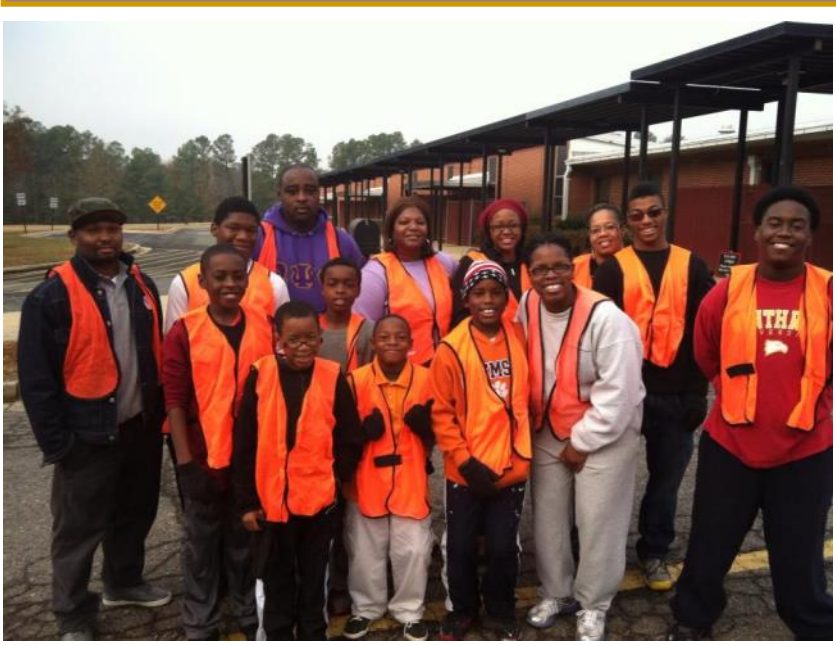
Kappa Alpha and Rock Hill Alumnae Chapter mentoring programs join forces to empower black males in York County. The groups partnered to complete the Adopt-a-highway community service project.

The Kappa Alpha Chapter of Omega Psi Phi Fraternity, Inc., held its semi-annual Adopt-a-Highway community service project on November 16, 2013 to conclude their Achievement Week Activities