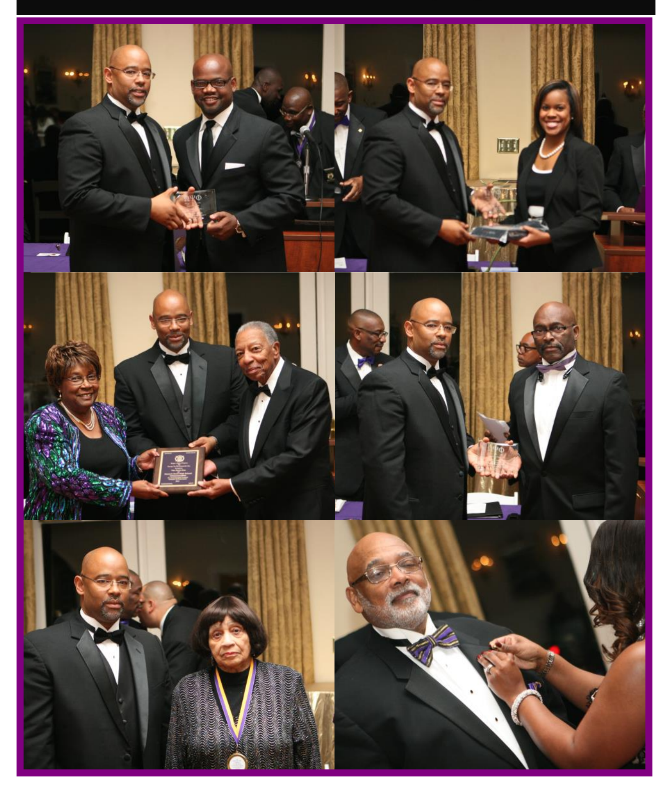
The Mighty Sixth District Centennial Chapter of the Year