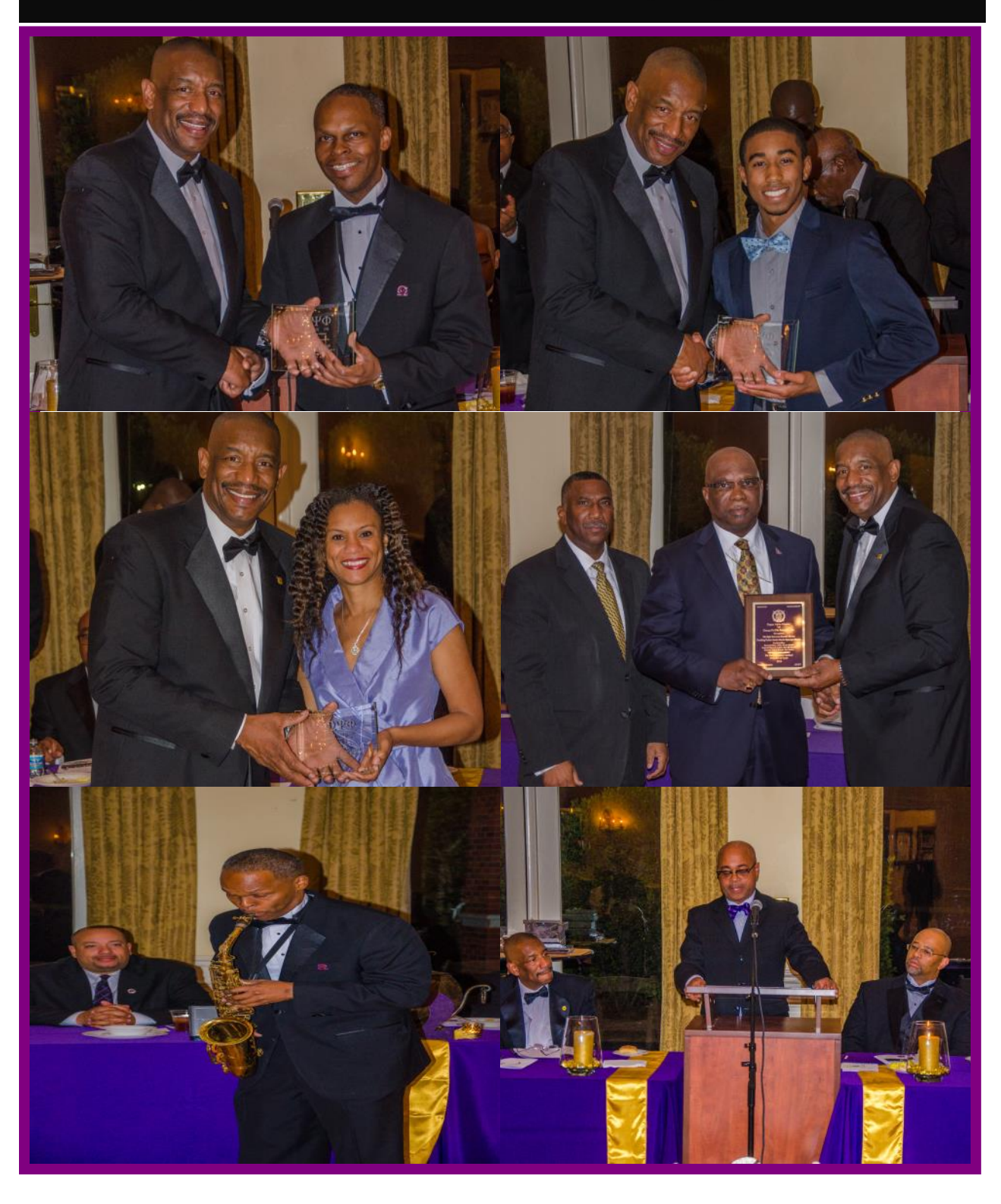
The Mighty Sixth District Centennial Chapter of the Year