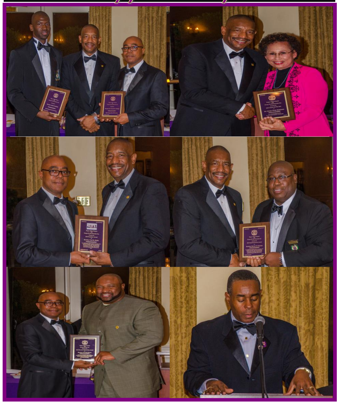
The Mighty Sixth District Centennial Chapter of the Year