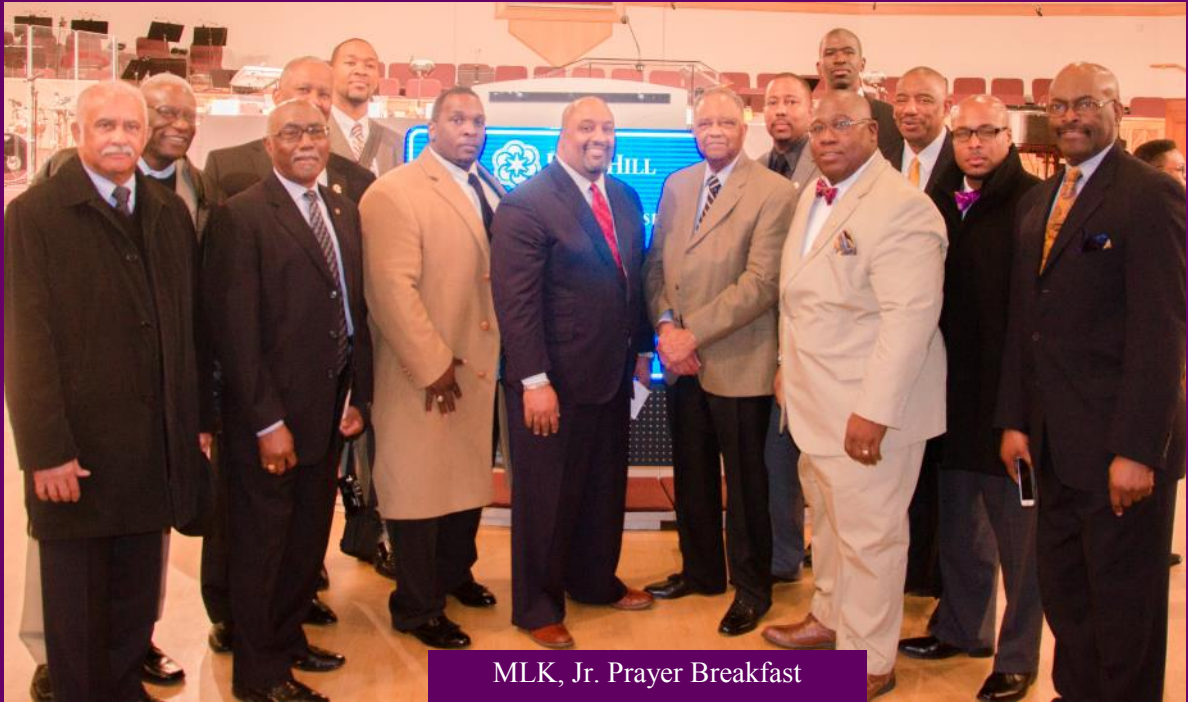
MLK, Jr. Prayer Breakfast