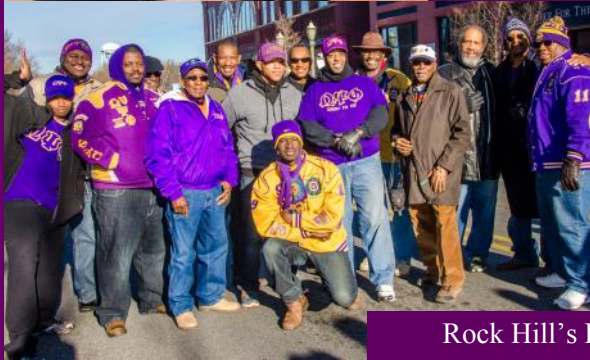
Rock Hill's Friendship 9