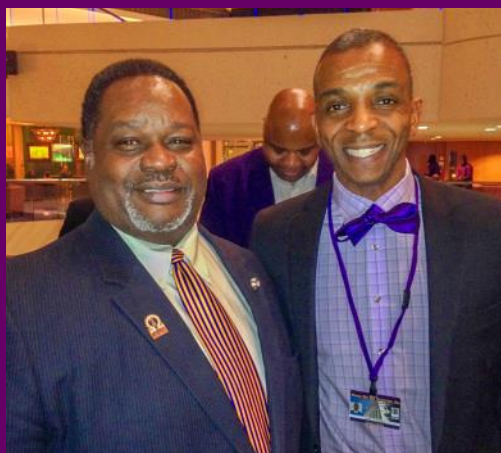
2015 Undergraduate Summit