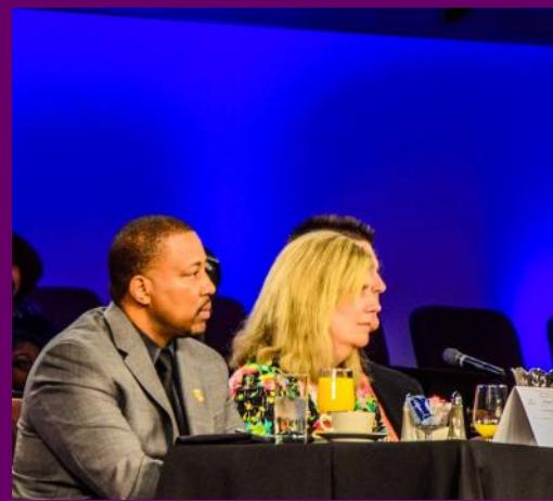
2015 MLK, Jr. Breakfast